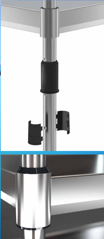
Durable shelf connection and strong welds for maximum load capacity

The VARIOCART withstands the toughest tasks.