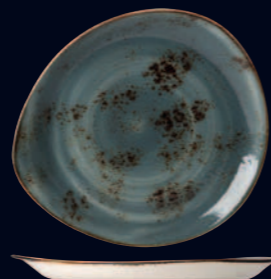
Plate 0520 30.5cm (12") 0521 25.0cm (10") 0522 15.5cm (6")