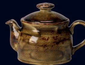
Club Teapot 0367 42.5cl (15oz)