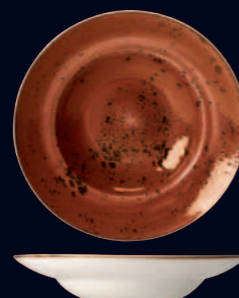
Nouveau 0372 27.0cm (10¾")