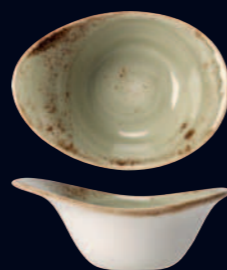
Bowl 0524 18.0cm (7") 0525 13.0cm (5")