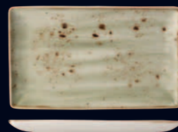
Rectangle One 0550 27.0cm x 16.75cm (10⅞" x 6½")