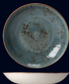
Coupe Bowl 0569 25.25cm (10") 0570 20.5cm (8½") 0571 13.0cm (5")