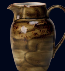
Decanter 0283 0.6 litre (1 pint)