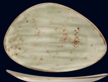
Plate 0501 37.5cm (14¾")