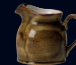
Club Jug 0387 14.25cl (5oz)