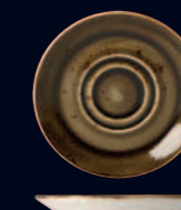
Soup Stand Double Well Slimline 0225 16.5cm (6½") Stand/Saucer Double Well Large 0158 14.5cm (5¾") Saucer Double Well Small 0165 11.75cm (4¾")