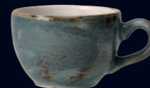
Low Cup 0150 45.5cl (16oz) 0152 34.0cl (12oz) 0189 22.75cl (8oz) 0190 8.5cl (3oz)