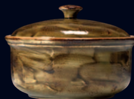
Casserole 0337 3 litre 5¼pt. (104oz) 0338 Casserole Lid