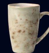
Quench Mug 0592 28.5cl (10oz)