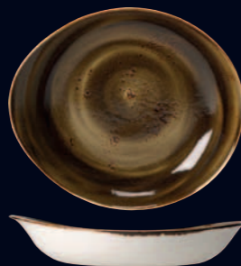
Bowl 0523 28.0cm (11")