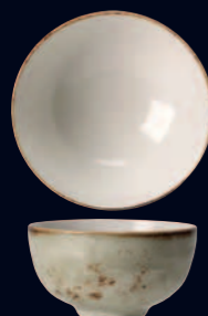
Chinese Bowl 0242 12.75cm (5")