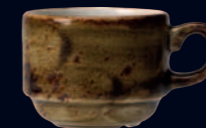
Cup Stacking 0188 28.4cl (10oz) 0217 20.0cl (7oz) 0234 10.0cl (3½oz)